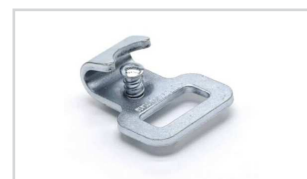
Flat hook with Safety device