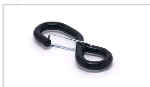
S-Hook with Safety device